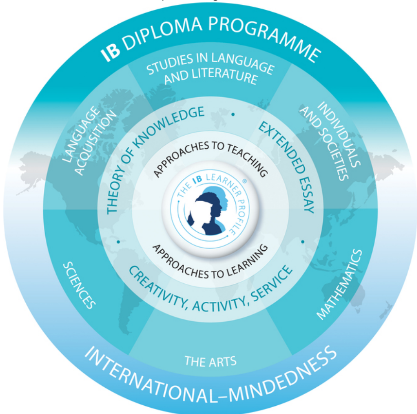
Figure 1 The Diploma Programme model

The course is presented as six academic areas enclosing a central core (see figure 1). It encourages the concurrent study of a broad range of academic areas. Students study two modern languages (or a modern language and a classical language), a humanities or social science subject, an experimental science, mathematics and one of the creative arts. It is this comprehensive range of subjects that makes the Diploma Programme a demanding course of study designed to prepare students effectively for university entrance. In each of the academic areas students have flexibility in making their choices, which means they can choose subjects that particularly interest them and that they may wish to study further at university.